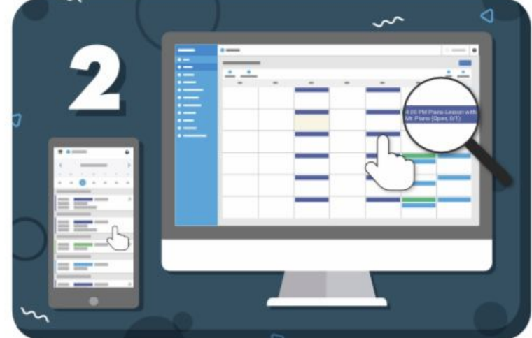
Click on the lesson you want to register for

Navigate to "Calendar" from the main menu on the left