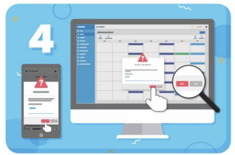
Read the cancellation policy and click "Yes" to confirm If you don't provide enough notice, you'll need to acknowledge the policy statement first

Have more questions? Check out the Help Center by clicking ? in the top right corner