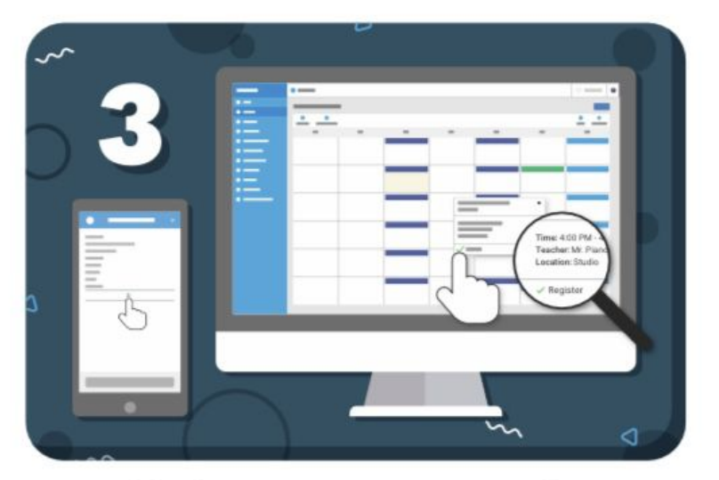
Click "Register" on the lesson details