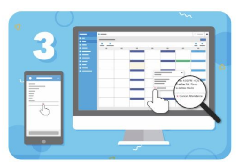
Select "Cancel Attendance" on the lesson details