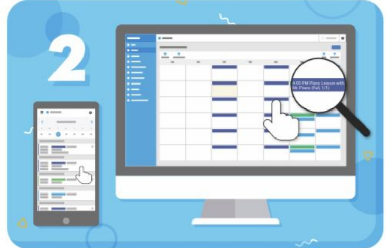
Click on the lesson you want to cancel

Navigate to "Calendar" from the main menu on the left